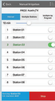
Quick Wet Check