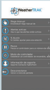
Available in Spanish

Turn your mobile smart device into a WeatherTRAK remote control, providing a complete smart water management system - anytime, anywhere.